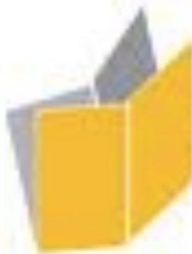
Half Fold then Half Fold