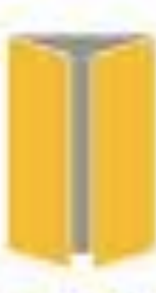
Open Gate Fold