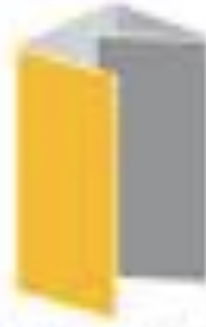
Roll Fold (4 panel)