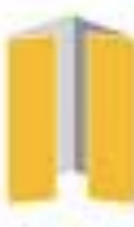
Closed Gate Fold