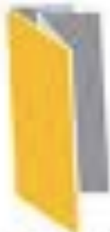
Double Parallel Reverse Fold