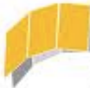
Half Fold then Tri Fold